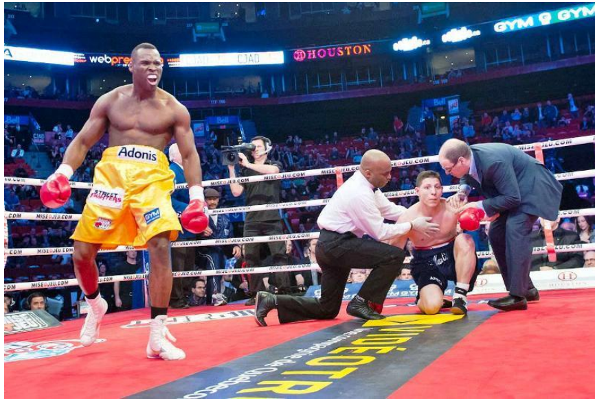
Adonis "Superman" Stevenson

MONTREAL (March 13, 2012) - The most feared puncher in boxing, International Boxing Federation ("IBF") No. 2 ranked Adonis "Superman" Stevenson , takes on World Boxing Council ("WBC") No. 2-rated Noe "El Carbonero" Gonzalez , April 20 on ESPN Friday Night Fights in a unification fight, as part of another installment of the popular Fast and Furious Series, live from the famed Bell Centre in Montreal.